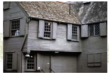
Exterior View, Revere House Courtyard

The solution: a temporary rear-lit graphic handrail system that directed visitors in a one-way traffic flow. The handrail limited full access to rooms, yet provided visitors with a personal and highly entertaining history of Paul Revere and his family.