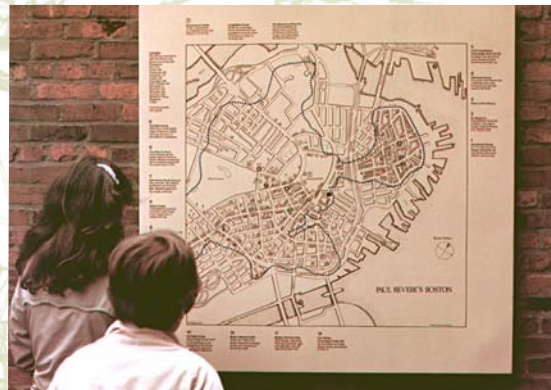
Map of Paul Revere's Midnight Ride

The solution: a temporary rear-lit graphic handrail system that directed visitors in a one-way traffic flow. The handrail limited full access to rooms, yet provided visitors with a personal and highly entertaining history of Paul Revere and his family.