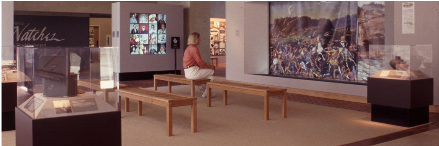
Main Exhibit Hall with "Motion" Mural

A center of the pre-Columbian mound-building culture, a frontier trading post and one of the wealthiest towns in pre-Civil War America, the City of Natchez is packed with a rich and diverse history. Lyons/Zaremba provided programming and exhibit design services to the City of Natchez for their visitor reception and inter-modal transportation center.