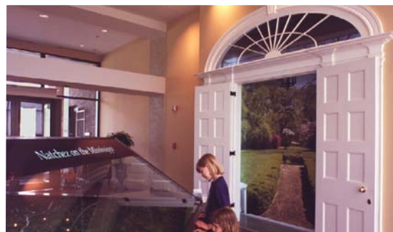
Glass Floor Peninsula Model

The exhibit design includes a mural based on a landscape painting by John James Audubon, an interactive steamboat pilot house and a series of storytelling exhibits. This project is developed in conjunction with the National Park Service and will serve as a model for future partnership projects.