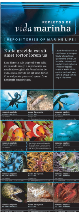
Multi-language Graphic Panel

The Madeira Archipelago, a part of Macaronesia, unite the Canary Islands, Azores, and Cape Verde Islands. It is a place of unique and unusual life forms. The new aquarium will take visitors on a tour down the volcanic islands' mountainside from the sub-tropical evergreen forests (a remnant of ancient forests that existed in Europe and North Africa before the last Ice Age) to the shore and undersea slopes that plunge nearly two miles to the abyssal plain.