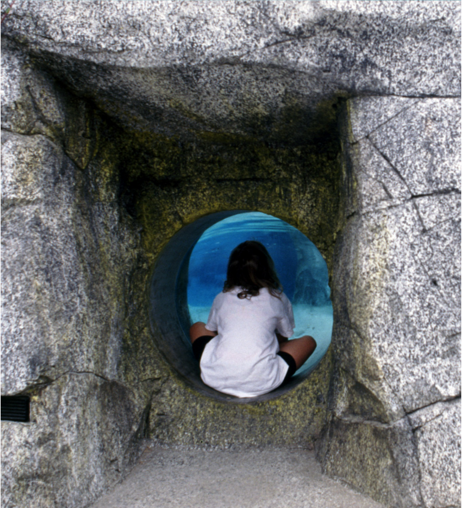
Mystic Aquarium Marine Mammal Exhibit