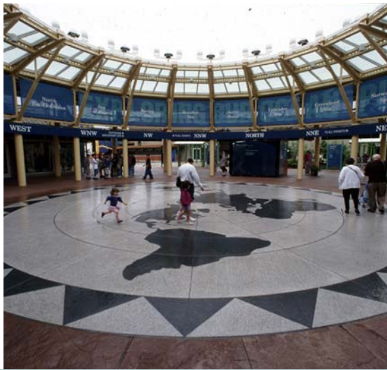
Entry/ Ticketing Pavilion