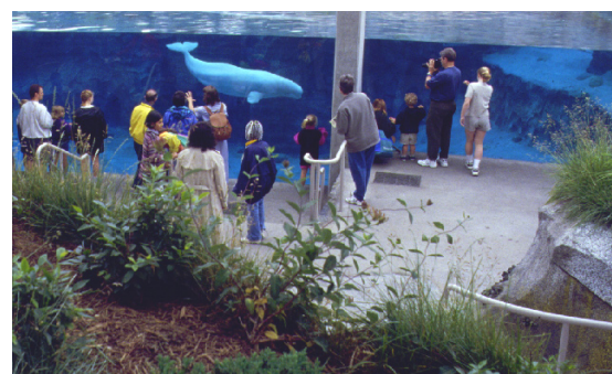
Beluga Whale Exhibit