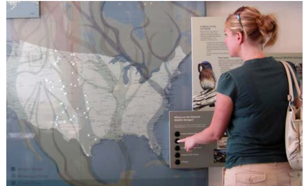
Migratory Bird Flyways Map

Accurate dioramas replicating sandy beaches, rocky shores, and other ecosystems surprise visitors with the state's diversity of life. Murals and large-scale photography, including a photo-mosaic of the iconic harlequin duck, illuminate the Service's mission to keep "Wildlife First."