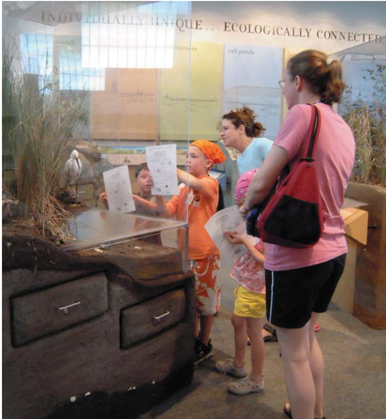
Children participate in a habitat scavenger hunt

The U.S. Fish & Wildlife Service contracted Lyons/Zaremba to design the interpretive exhibits that orient visitors to six coastal Rhode Island National Wildlife Refuges. Under the Service's theme "individually unique, ecologically connected," the exhibits inform visitors about the vital life support network these refuges provide for hundreds of animal and plant species—some of which are rare and endangered.