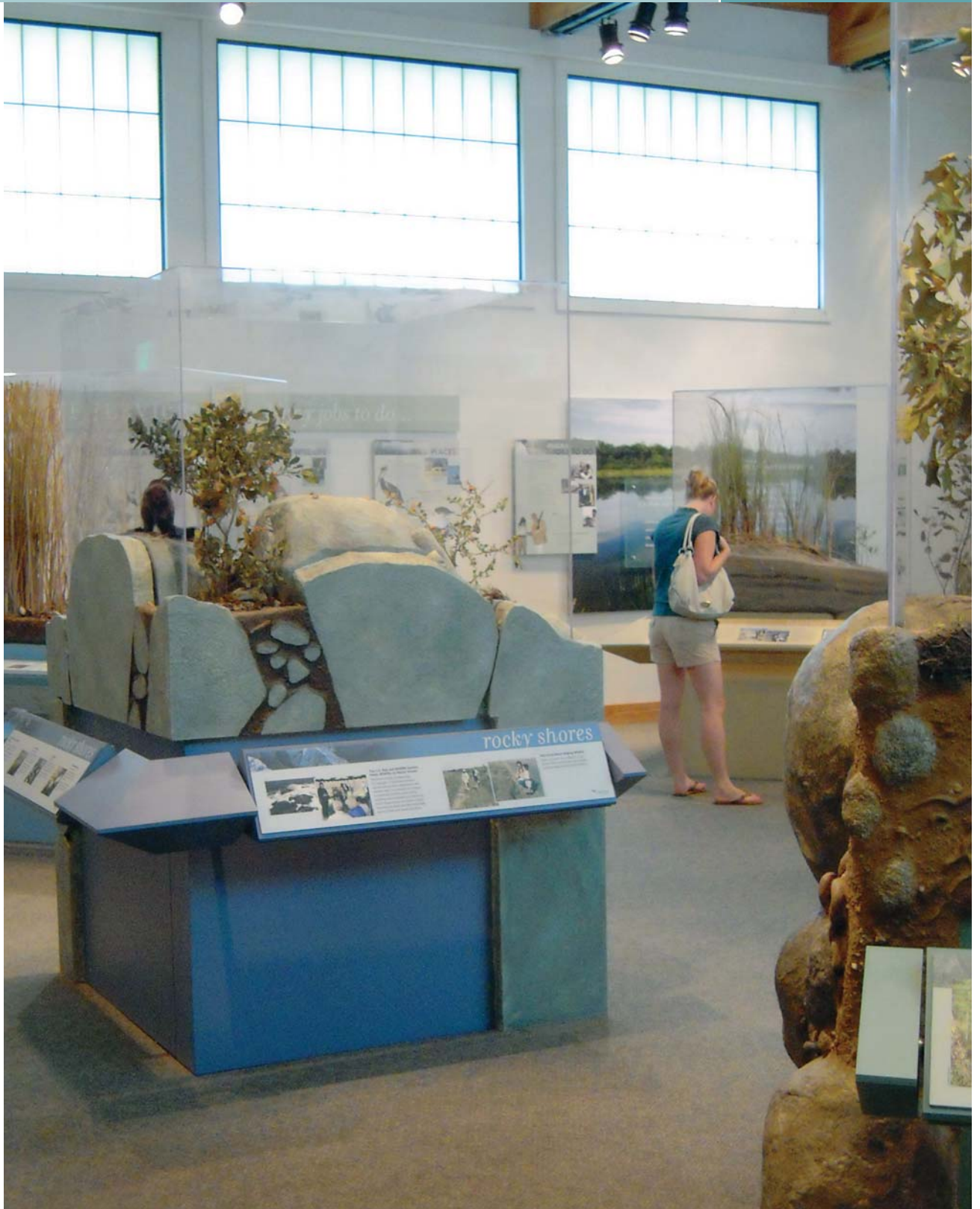
Dioramas with trilons