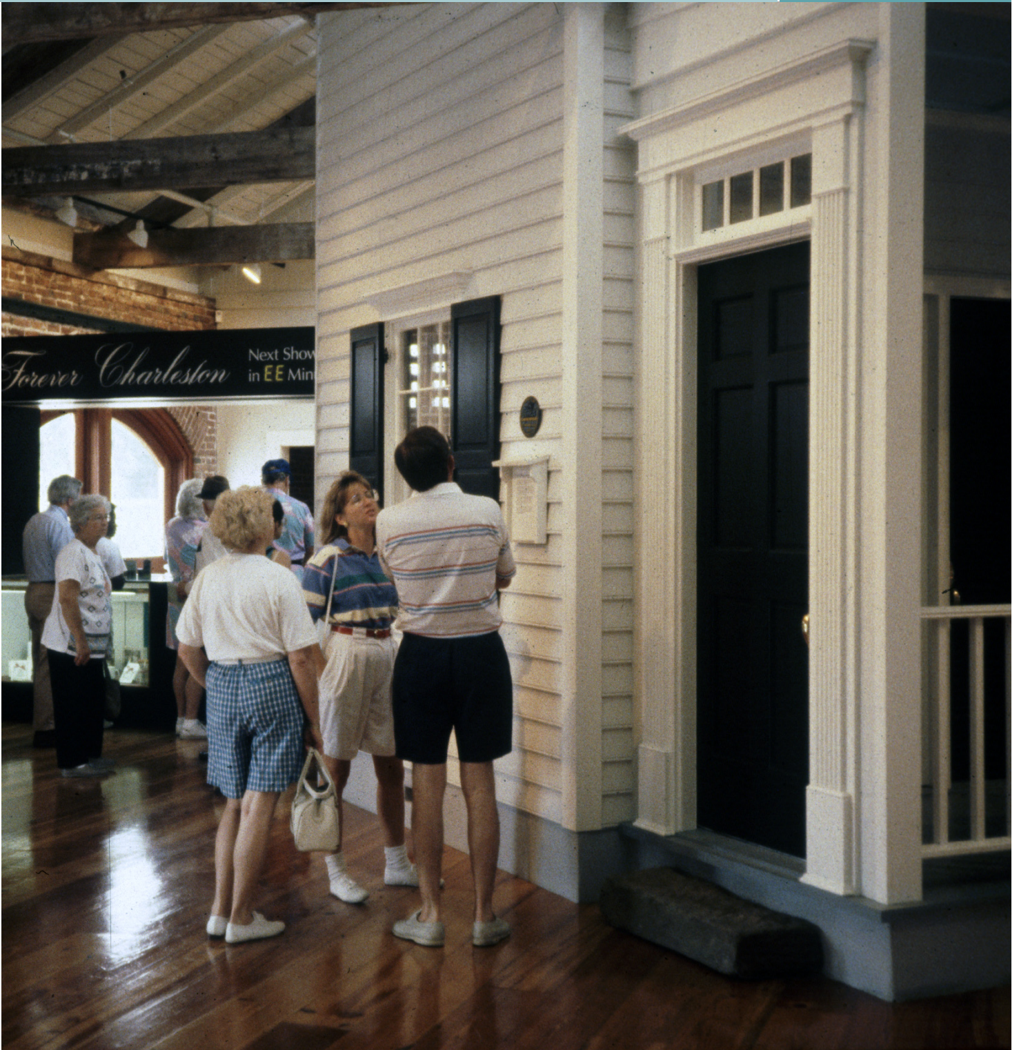
Replicated "Single" House at Charleston Visitor Center