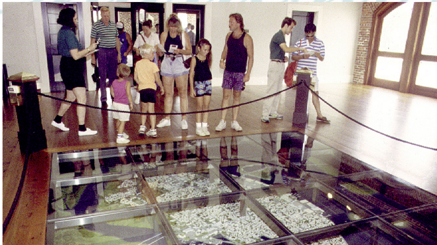
Glass Floor Peninsula Model

Today the completed center is located in the restored 19th century J.R. Deans Warehouse—the site of America’s first passenger railroad station. Visitors venture over a model of the city, into a re-created “single” house and through interpretive and interactive exhibits. The center also brings together visitors and craftspeople in a lively marketplace, where visitors can purchase and take home a memory of Charleston.