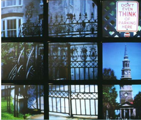
Video Wall Exhibit