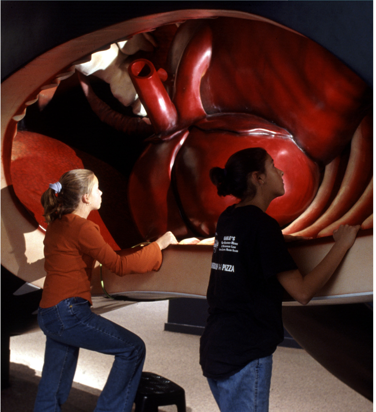
Cut-Away View Into the Life-Size Right Whale at Audubon Society of Rhode Island's Environmental Education Center