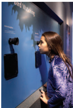
Bird Watching Exhibit

The Audubon Society of Rhode Island selected Lyons/Zaremba Inc. to program and design the exhibits for Audubon's flagship Environmental Education Center, which is located on Audubon's 26-acre Bristol property. The exhibits orient visitors to on-site farmlands, meadows, ponds, marshes, beaches, salt marshes, and the coastal environment of Narragansett Bay. The main message: Rhode Islanders are linked to important ecosystems—some of which may be as close as their own backyards.