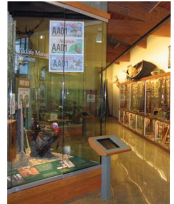
AGFC Division Display Cases