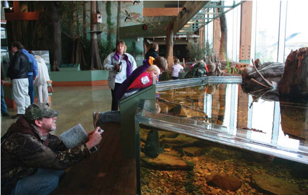
Arkansas River aquarium